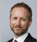
Bård Vegar Solhjell