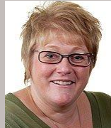
Trine Skei Grande