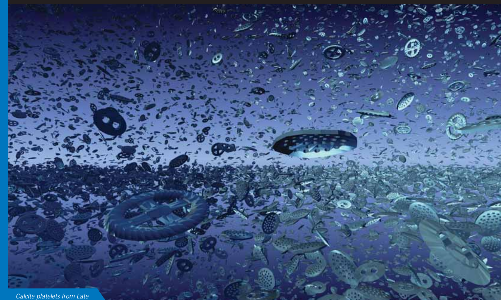
Calcite platelets from Late Cretaceous calcareous algae