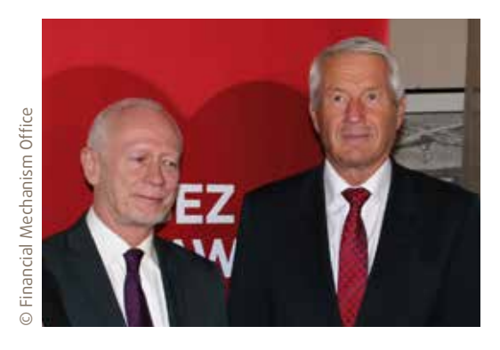
Thorbjørn Jagland, Secretary General of the Council of Europe (right) with Michal Boni, Minister of Administration and Digitization of Poland at the conference 'The Hate Factor in Political Speech' in Warsaw in September 2013.

Thorbjørn Jagland, Secretary General of Council of Europe