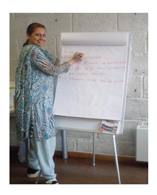
Picture 1 and 2: Facilitators in the minority version of the ICDP teaching and role playing