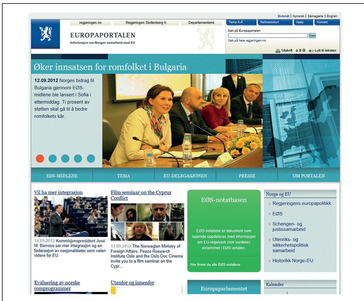
Figure 4.1 An upgraded European portal was launched in summer 2012. The new portal is a comprehensive source of information on Norway's cooperation with the EU.

ried out by the Sentio Research Group in May 2011 in connection with the preparation of Official Norwegian Report NOU 2012:2 Outside and Inside: Norway's agreements with the European Union , young people in particular reported that their knowledge of these areas was poor. Both the official report itself and a large number of comments received in connection with its preparation indicate a need to increase efforts to enhance young people's knowledge of Norway's agreements with the EU. Knowledge of the EU/EEA is one of the subject areas included in the current national curriculum for social studies and in the learning objectives set for years 7, 10 and the first year of upper secondary school. The Government will support the work carried out by schools to ensure that these learning objectives are achieved. It is important for young people to have access to up-to-date and neutral information. The Government will therefore facilitate the develop-