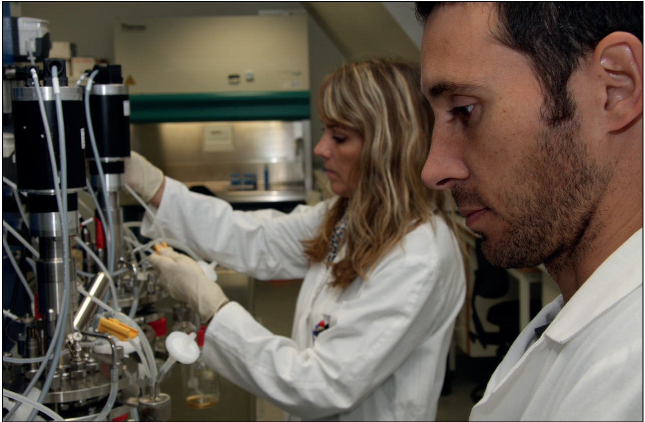
Figure 3.1 The Norwegian company Pharmaq has received funding under the EU's Eurostars Programme to develop new salmon vaccines, together with the Swedish company Isconova. The Eurostars Programme provides funding to research-performing small and medium-sized enterprises.