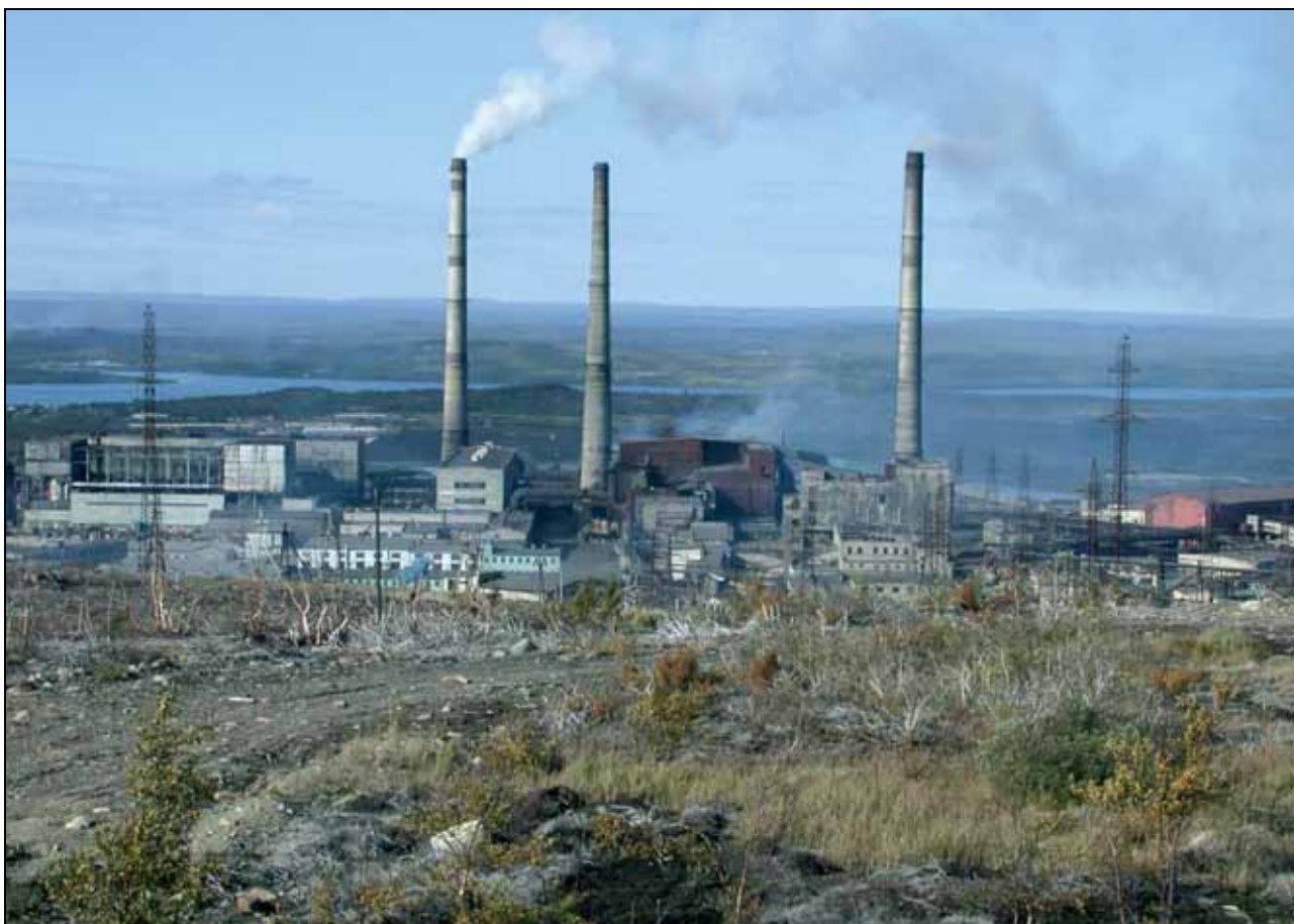
Figure 2.4 The nickel works in Nikel

The Arctic areas are particularly vulnerable to climate change. There is a good deal of evidence that climate change in the Arctic may be more rapid and unpredictable than previously thought. The results of the Arctic Climate Impact Assessment (ACIA), which were presented to the Arctic Council in autumn 2004, show that climate change is already taking place in the Arctic. Winter temperatures in parts of the Arctic have risen by 3–4 degrees Celsius in the last 50 years, and the mean temperature in the region has risen considerably more than the global mean temperature in the same period. The extent of the sea ice in summer has decreased markedly in the last few decades, and this trend is expected to accelerate. The impacts of climate change on the environment, living resources and human health may be substantial. Thawing of the permafrost may cause damage to buildings, roads and other infrastructure.