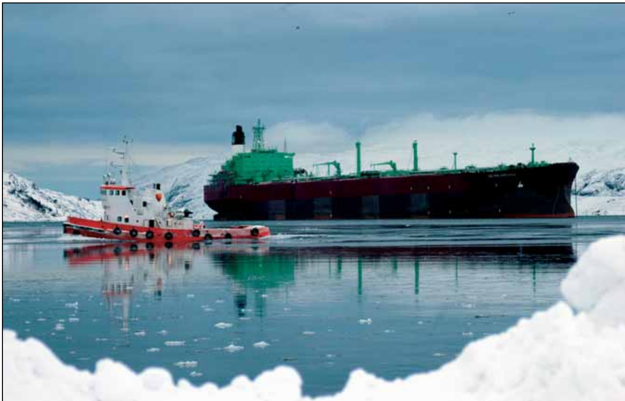
Figure 2.5 The floating oil storage facility Belokamenka