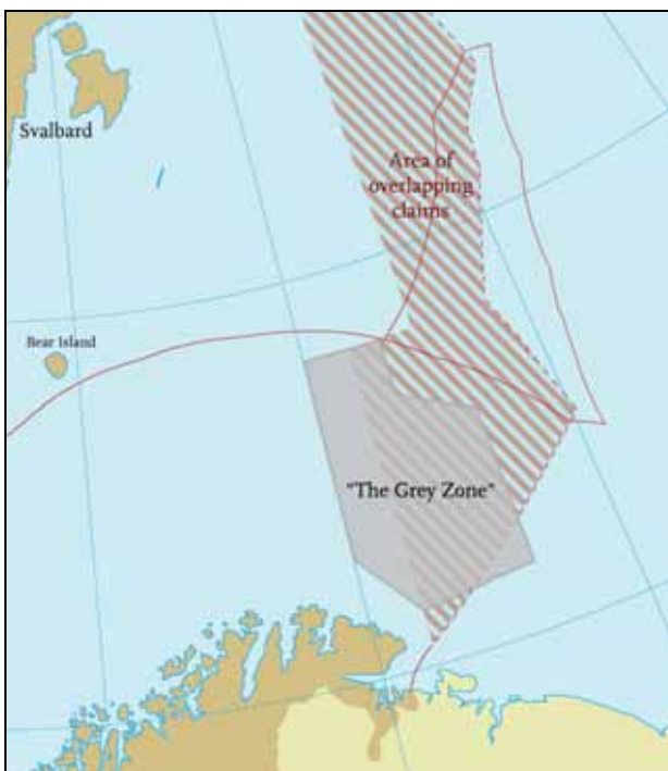
Figure 2.3 Norway and Russia are engaged in consultations on the delimitation of an area of overlapping claims, whereas fishing activities in the «grey zone» are governed by a provisional agreement.

The co-operation between Norway and Russia on fisheries management in the Barents Sea faces certain challenges. A difference of views on the principles on which the establishment of the Fisheries Protection Zone around Svalbard is based has in certain cases led to protests concerning Norwegian regulatory and enforcement measures. The