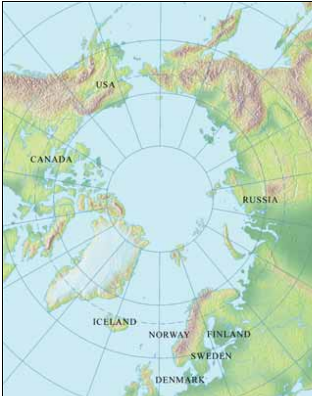
Figure 5.2 Member states of the Arctic Council

In the Government's view, the Arctic Council should continuously update the scientific knowledge base related to climate change in the Arctic, for example in the form of special surveys as a continuation of the ACIA process. The ACIA efforts could be an important regional contribution to the Intergovernmental Panel on Climate Change (IPCC). The Arctic Council and its member states have an important role to play in describing, assessing and imparting knowledge about the impact of climate change on the Arctic, and the consequences this may have for the global environment. In this way the Arctic Council can help to ensure that new knowledge about climate change in the Arctic reaches the right fora, including the IPCC.