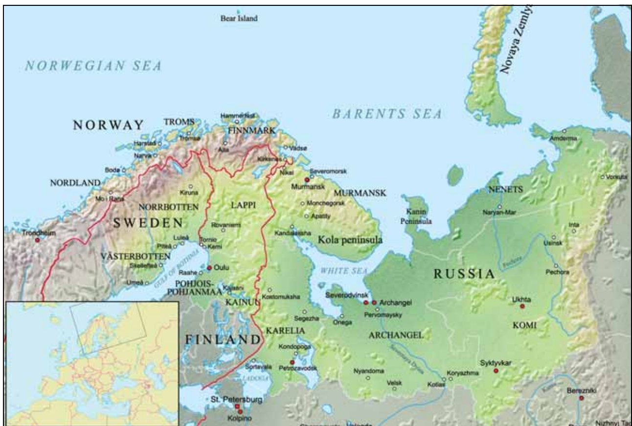
Figure 5.1 The Barents Region

The Barents Co-operation provides a framework both for political contact and for co-operation on concrete measures. Particular emphasis is placed on measures in the areas of trade and industry, transport, energy, environmental protection,