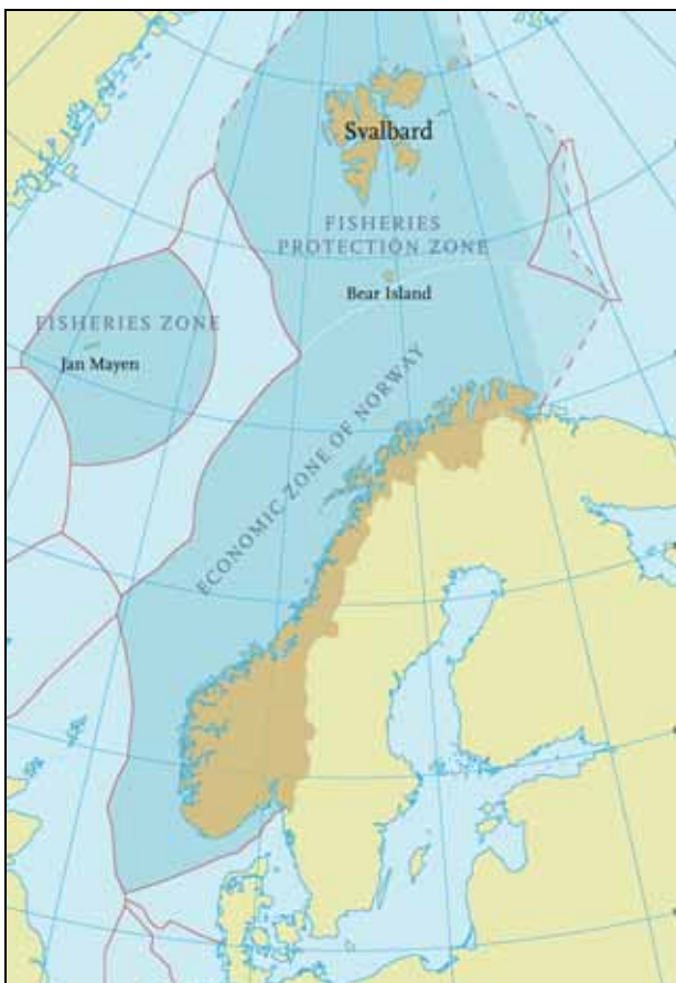
Figure 3.1 Norwegian 200-mile zones, established in accordance with the existing law of the sea

During President Putin's visit to Oslo in November 2002, Prime Minister Bondevik and the Russian President confirmed that both Norway and Russia give high priority to the timely conclusion of an agreement on a delimitation line for the continental shelf and the 200-mile zones in the Barents Sea. Considerable progress has been made in the consultations, which started in 1970 with regard to the continental shelf and since 1984 have also included the zones. The two parties agree to continue the discussions on the basis of a comprehensive approach that takes account of all relevant ele-