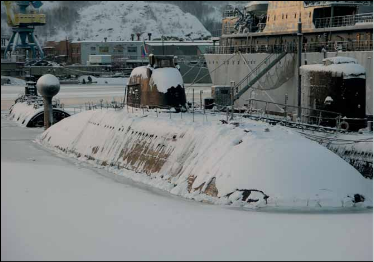
Figure 4.2 Decommissioned Victor III submarine to be dismantled at the Nerpa Shipyard outside Murmansk