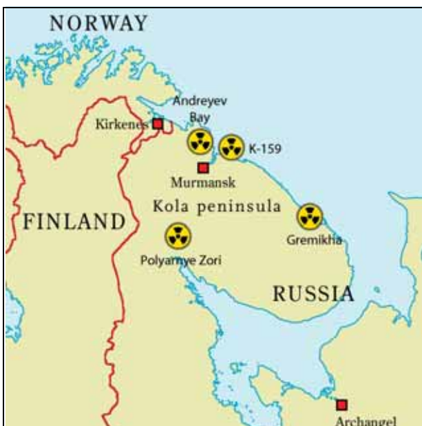
Figure 4.1 Nuclear facilities on the Kola Peninsula

The scope of the nuclear safety co-operation with Russian has been increasing during the past few years, and large, complex projects have been initiated. This has necessitated a review of the distribution of roles between the Ministry of Foreign Affairs, the Norwegian Radiation Protection Authority and project managers. The Norwegian Radiation Protection Authority is now the directorate responsible for implementing this co-operation with Russia on behalf of the Ministry of Foreign Affairs.