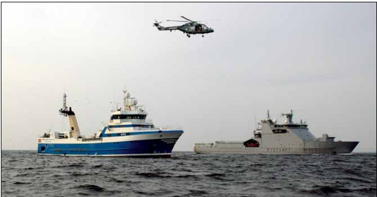
Figure 2.1 Coast Guard vessel Svalbard conducting a fisheries inspection

Since the mid-1990s natural resource issues have become increasingly prominent. At first political attention focused on the large oil and gas