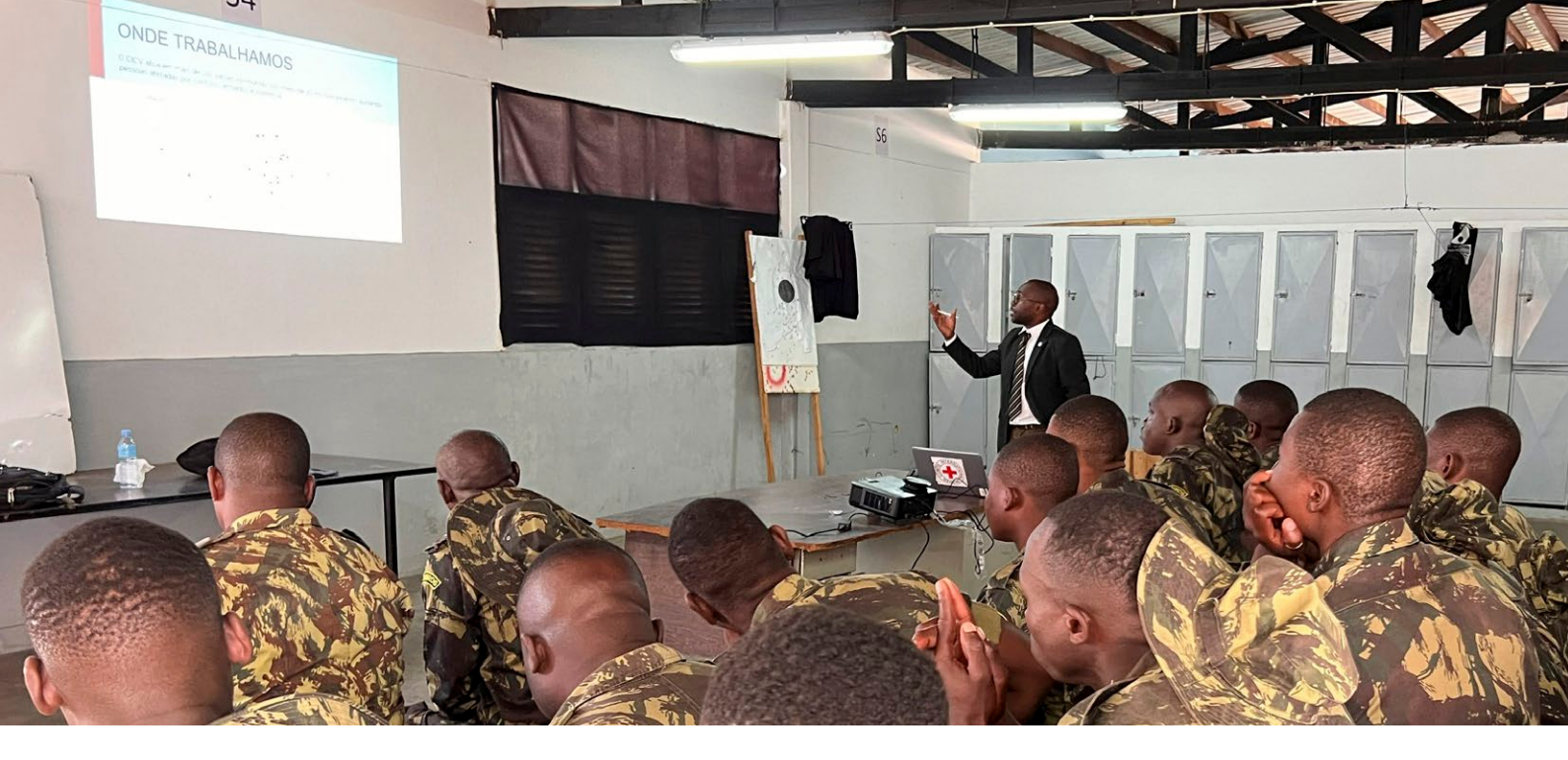
ICRC provides training on International Humanitarian Law to soldiers of Mozambique's defence forces

moting increased compliance with international law, including on the part of these groups. State actors also violate international law in many armed conflicts. Political will, in addition to knowledge, training and leadership in the armed forces, is key to ensure the protection of civilians. The development of new weapons technology, such as autonomous weapons, and the use of unconventional warfare, including cyberattacks, also add to the challenges regcompliance with the established rules of international humanitarian law.