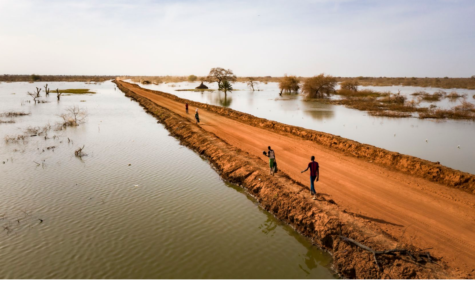
Thousands of people are permanently displaced after years of flooding in Bentiu, South Sudan. This road is protected by dykes and cuts through the floodwater. The road stretches all the way to the horizon, near Bentiu.