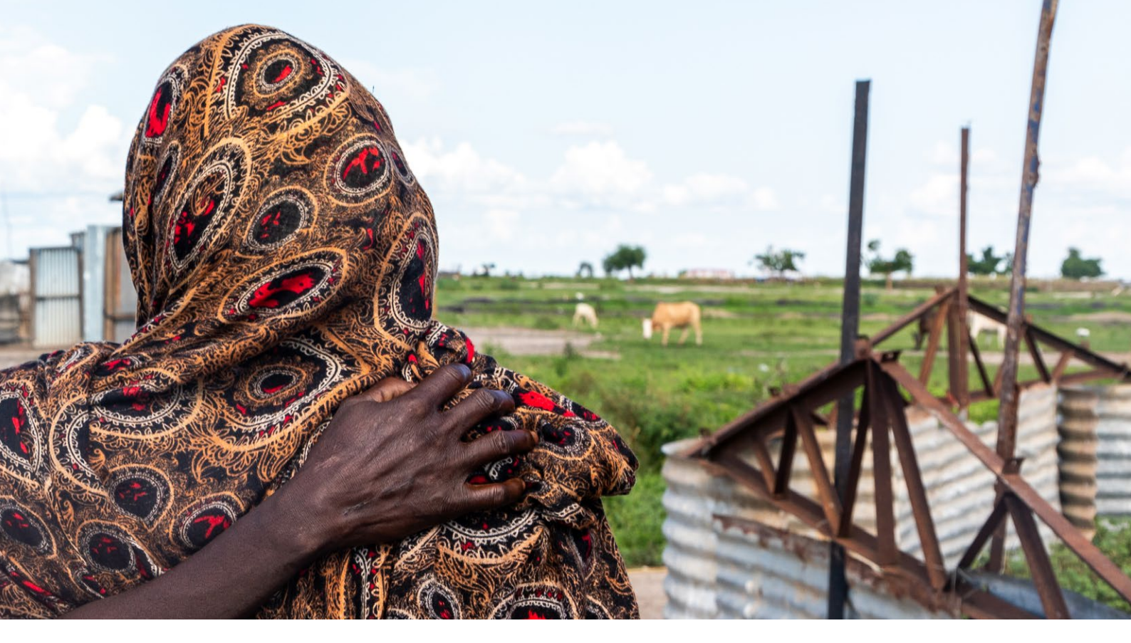
September 2023. The UNFPA, with the support of the CERF Fund, has set up a safe space exclusively for women in this camp for internally displaced, where they can feel safe and are less at risk for sexual and gender-based violence.

and breaks down social structures. Children conceived as a result of rape in armed conflict, and other children who have biological parents from opposing sides of a conflict, are particularly vulnerable.