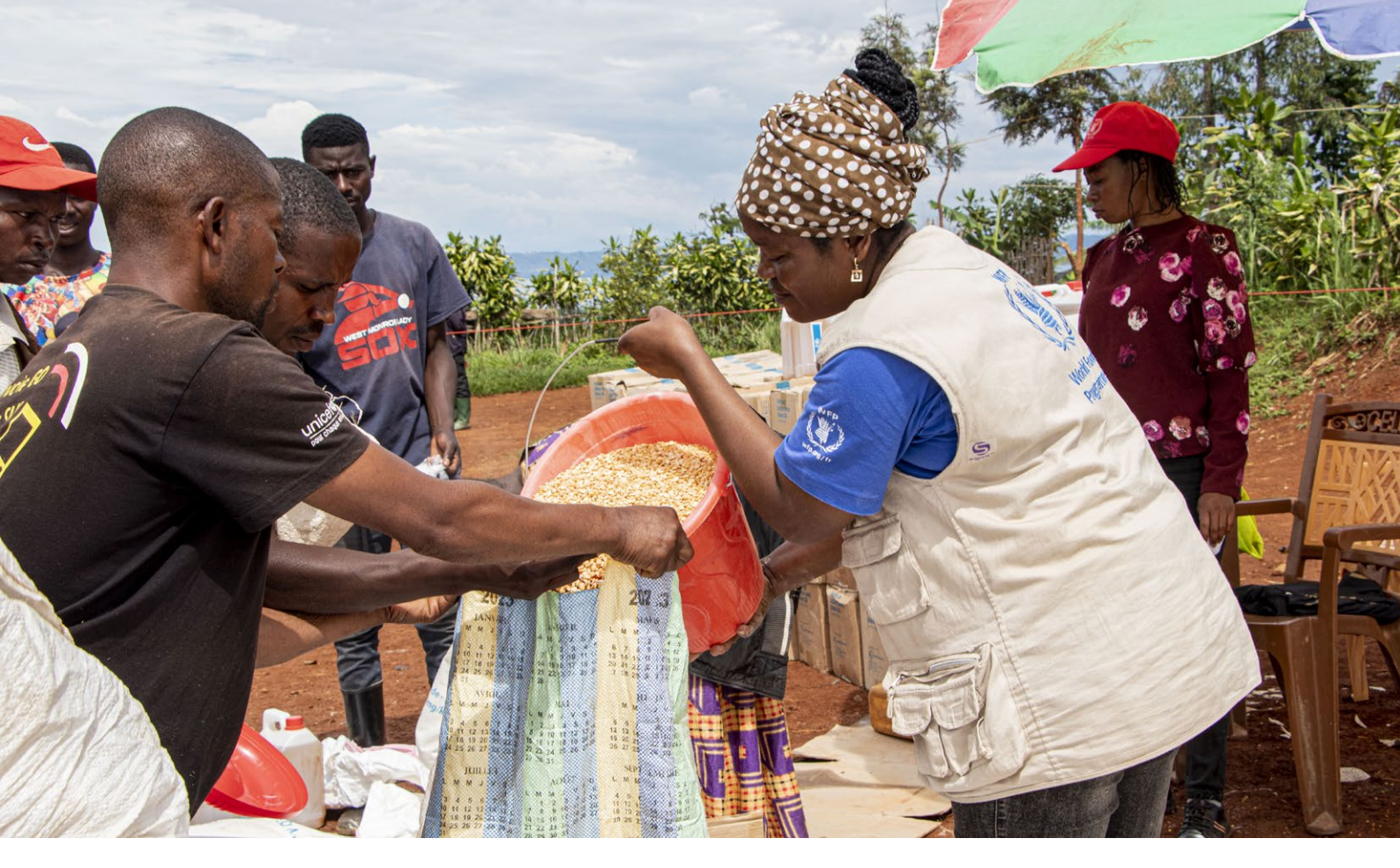
WFP supporting victims of fires and floods in Kalehe, South Kivu, in the Democratic Republic of the Congo.