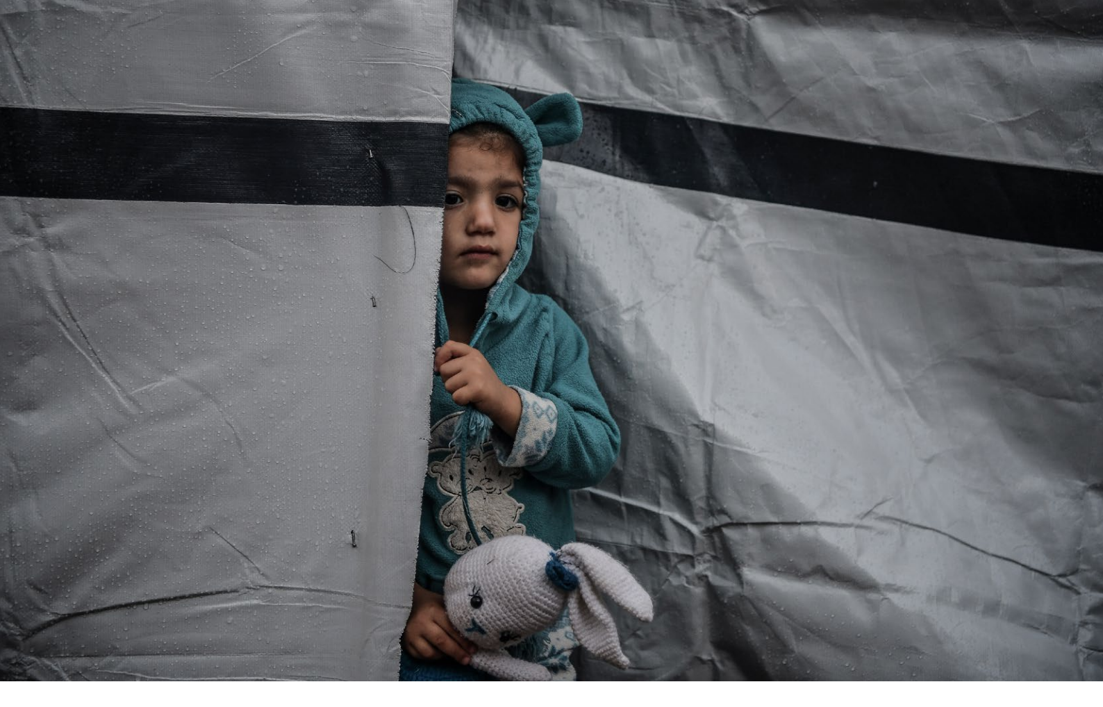
Everyday life in Khan Younis, Gaza, November 2023.