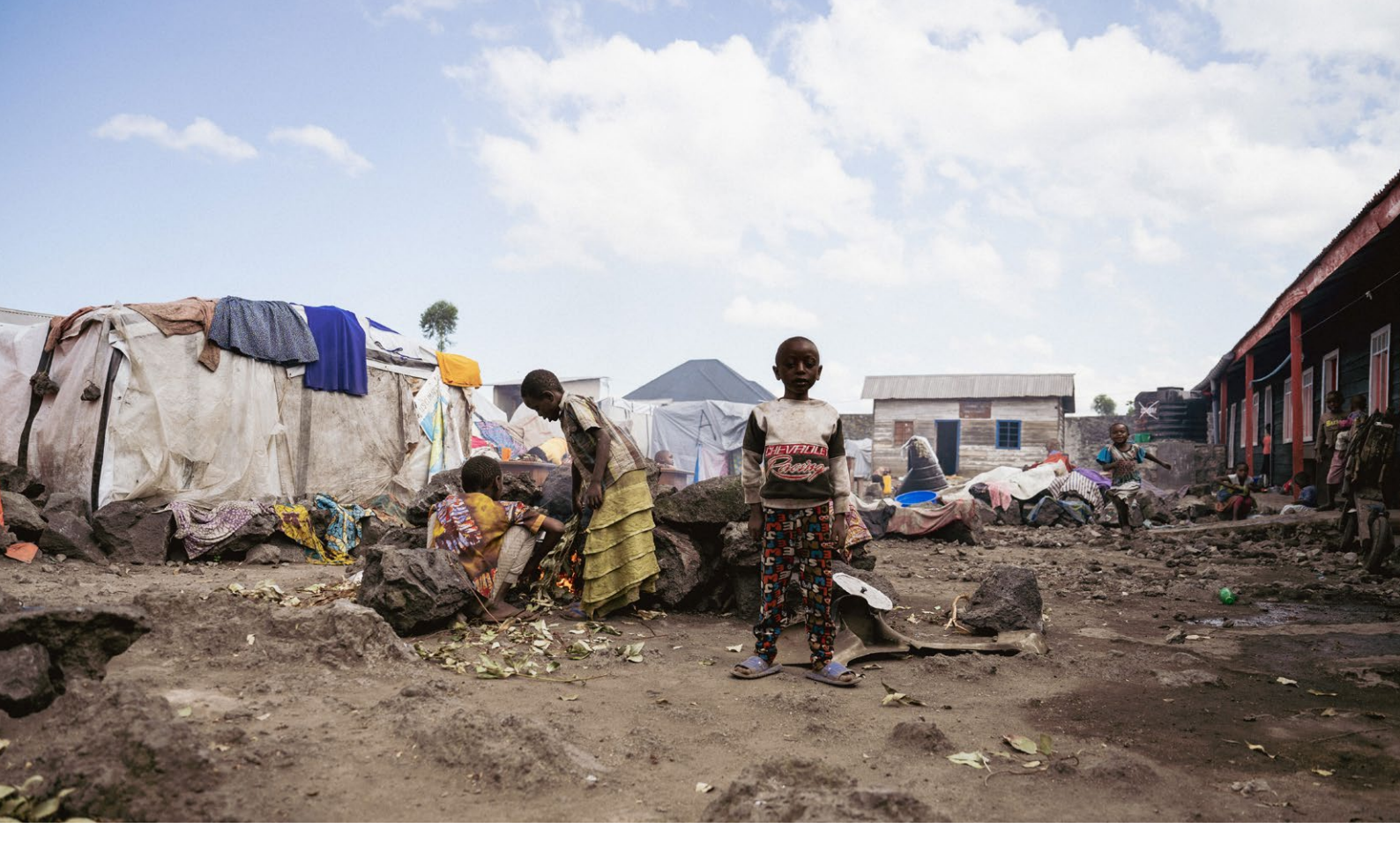
Recurring attacks which have hit Rutshuru in North Kivu, in the Democratic Republic of the Congo, have created a massive influx of displaced towards Goma. In only a few months, in 2023, more than 500,000 people were displaced.