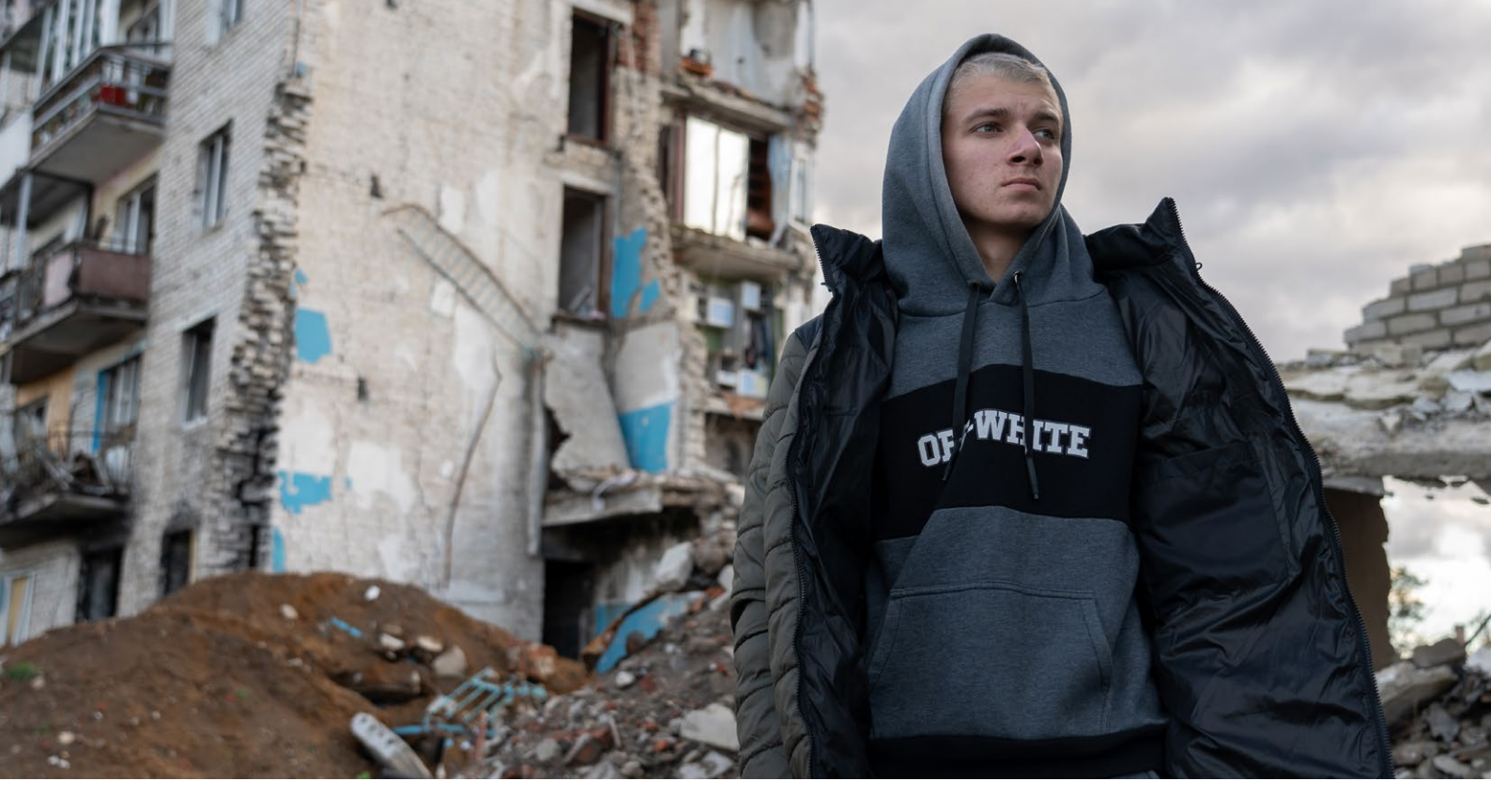
17-year-old Habriel stands at a bus stop riddled with shrapnel in the Ukrainian city of Izium. Here, 80 per cent of the landscape lies in ruins. Photo: © UNICEF/UNI484041/Filippov Ukraine, 2022