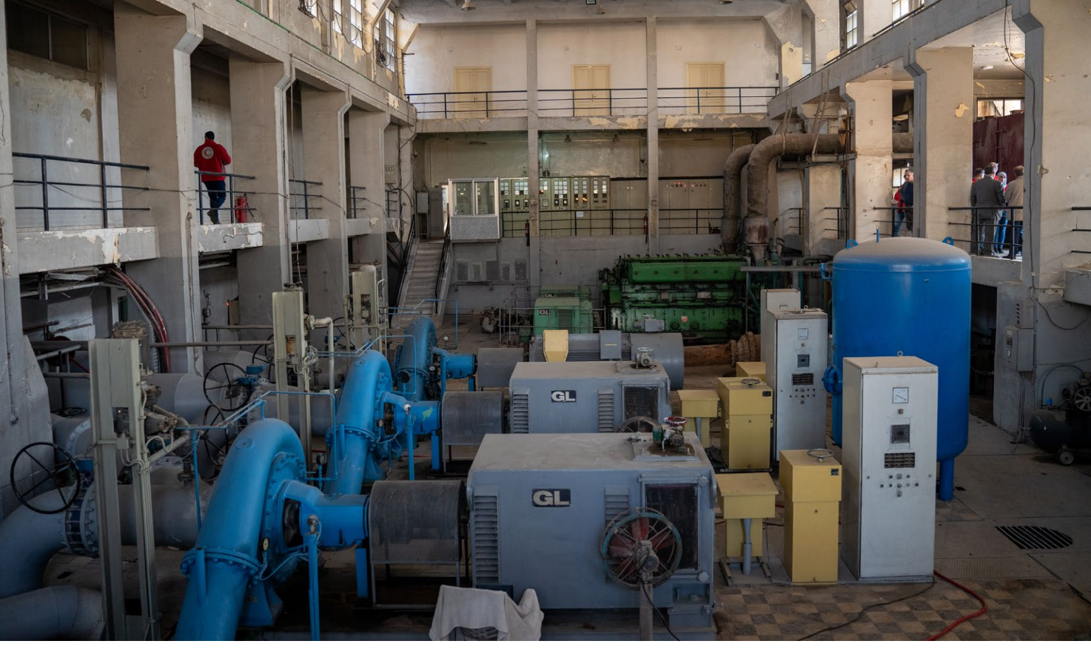
Aleppo, Syria, December 2022. The Karam El Jablal Pump Station in Aleppo city transports water into the city from the source which is 90 kilometres away.