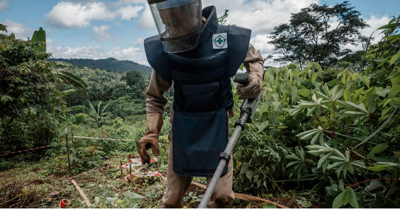
Demining in progress. Norwegian People's Aid clears a large minefield in Tula Sanji, Angola.