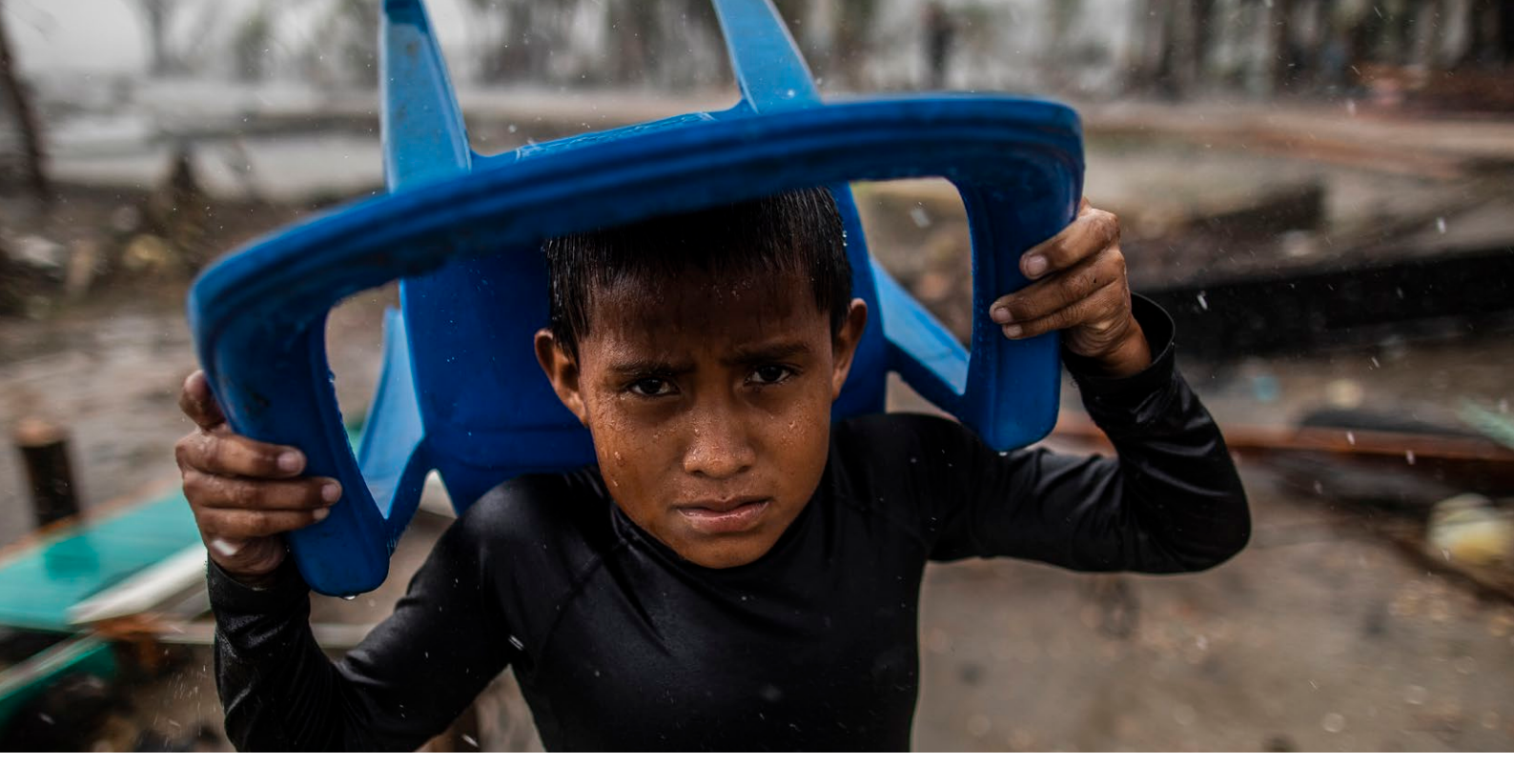
A child in Bilwi, Nicaragua, protects himself from the heavy rain with a plastic chair. He is standing in the spot where his house used to be, after it was destroyed by Hurricane lota