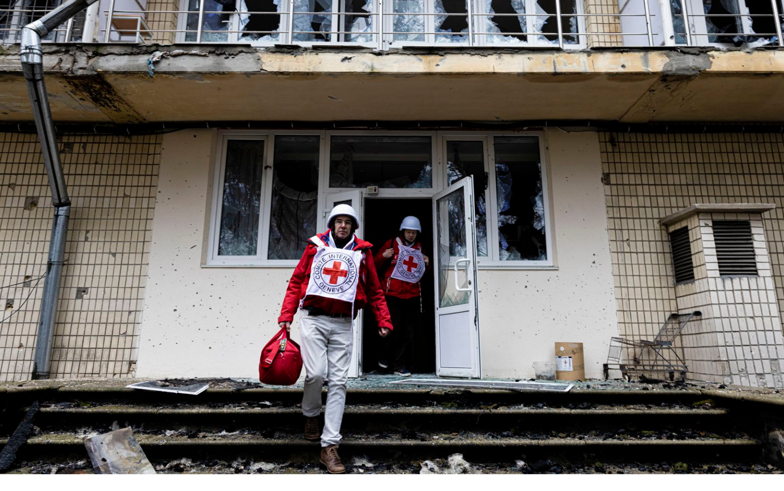
Military hospital in Irpin, near Kyiv, the capital of the Ukraine. The city has been the theater of heavy fighting. The hospital is empty and heavily damaged. ICRC assessing the needs, providing first aid, and distributing food to the people who stayed on in the city.