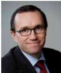
Espen Barth Eide