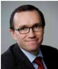
Espen Barth Eide