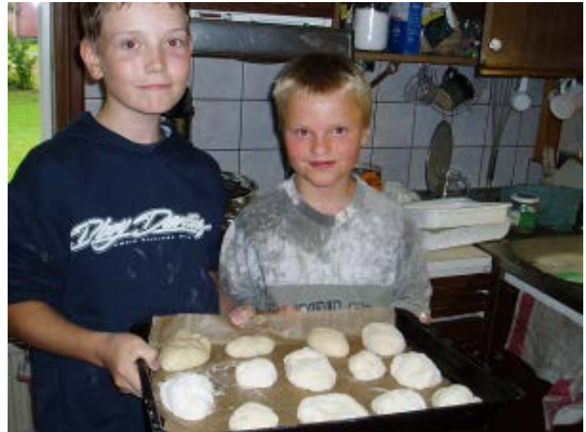
Outward Bound Finland

Maalle Oppimaan, http://www.agronet.fi/leirikoulu/etusivu.html