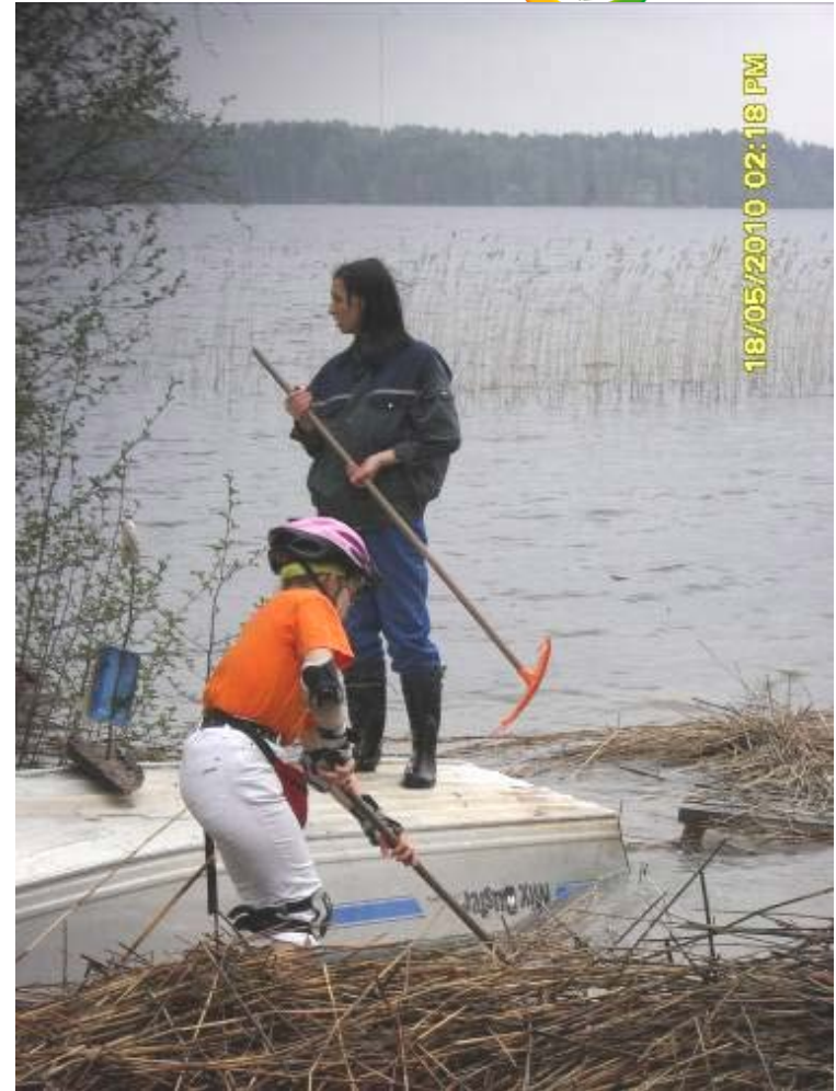
Work and rehabilitation at Hakamaa farm in Nastola