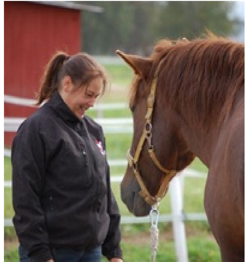
Socio-pedagogical horse activities at Toiska stable