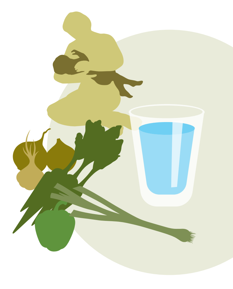
24 WHO Health topics: Breastfeeding

Non-communicable diseases reduce the life quality of those affected and their families, place a huge economic burden on national health budgets, and lead to a reduction of the potential labour force. Although the main problem in low-income countries remains a lack of sufficient nutritious food, these countries are also seeing a growing trend towards consumption of unhealthy food, especially in the expanding urban areas. The fact that a diet based on industrially processed food may be cheaper but less nutritious than a diet based on local foods and traditions is a problem that has implications for the fight against poverty. Efforts to preserve good local food traditions are important in light of marketing of unhealthy foods and drinks.