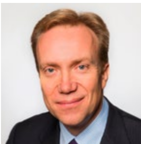
Børge Brende MINISTER OF FOREIGN AFFAIRS

We welcome the global engagement to work towards fulfilling the 2030 Agenda. It is our responsibility to build economically, socially and environmentally sound societies for both current and future generations.