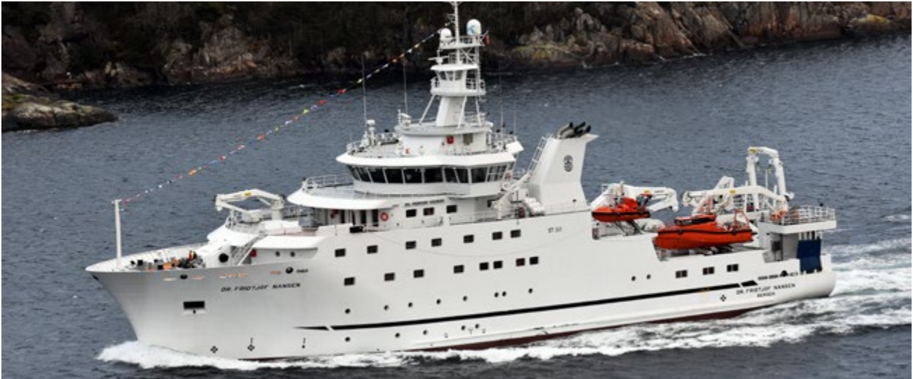
The new Norwegian R/V Dr. Fridtjof Nansen is the world's most modern research vessel. It part of the Nansen-programme, established in cooperation with FAO more than 40 years ago with the purpose of assisting developing countries to manage their marine resources in a sustainable manner.