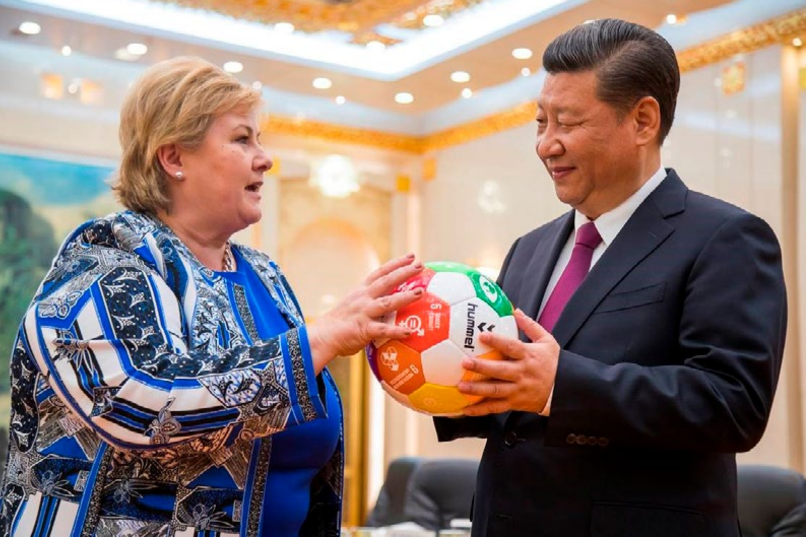
Prime Minister of Norway, Erna Solberg, meeting with President Xi Jinping in China in April 2017. The Prime Minister brought a soccer ball with the 17 Sustainable Development Goals as a gift to the President. This summer, thousands of children and youth will use identical soccer balls at Norway Cup.