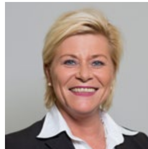
Siv Jensen MINISTER OF FINANCE