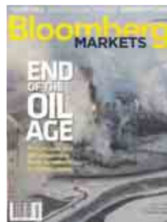
Bloomberg Markets, March 2008.

It is probable that section 526 of the US Energy Security Act (see page 19), the California Low Carbon Fuel Standard and the US Mayor's resolution has caused such anxiety among industry proponents. While many of the big oil and gas companies involved in tar sands, such as Shell, BP, ExxonMobil and Chevron, are adept at handling protests from local communities and international environmental groups, the scale and spread of the tar sands footprint is potentially exposing them to a variety of threats that they may have to fight on multiple fronts. Box 4 lists some of the significant civil society opposition to tar sands development.