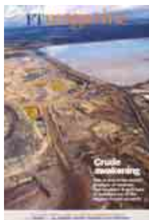
Financial Times magazine, 15 December 2007.

This wave of negative publicity has triggered major publicity campaigns by the tar sands industry. The Alberta government launched a C$25 million campaign in April 2008 to counter negative publicity building in the USA. Only days later, the death of 500 ducks on a toxic tailings pond at one of Syncrude Canada's mining operations stole the headlines. 122 Tar sands companies including Shell, 123 launched a website in June called Canada's Oil Sands: a different conversation. 124 The website aims to 'listen and respond more effectively to concerns about the environmental and social impacts of developing Canada's oil sands.' Visitors can post their answers to questions posted on the front page of the site or sign up to participate in an ongoing discussion forum.