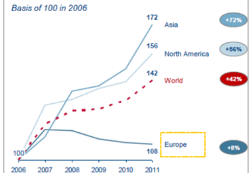
Revenues of network operators by region (1)

▶ European telco's revenue growth is 7 to 9 times lower than in Asia and North America